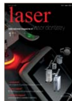
Cover image courtesy of Fotona, www.fotona.com